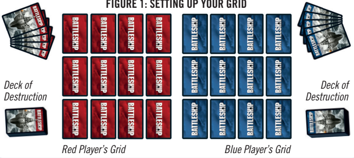
FIGURE 1: SETTING UP YOUR GRID